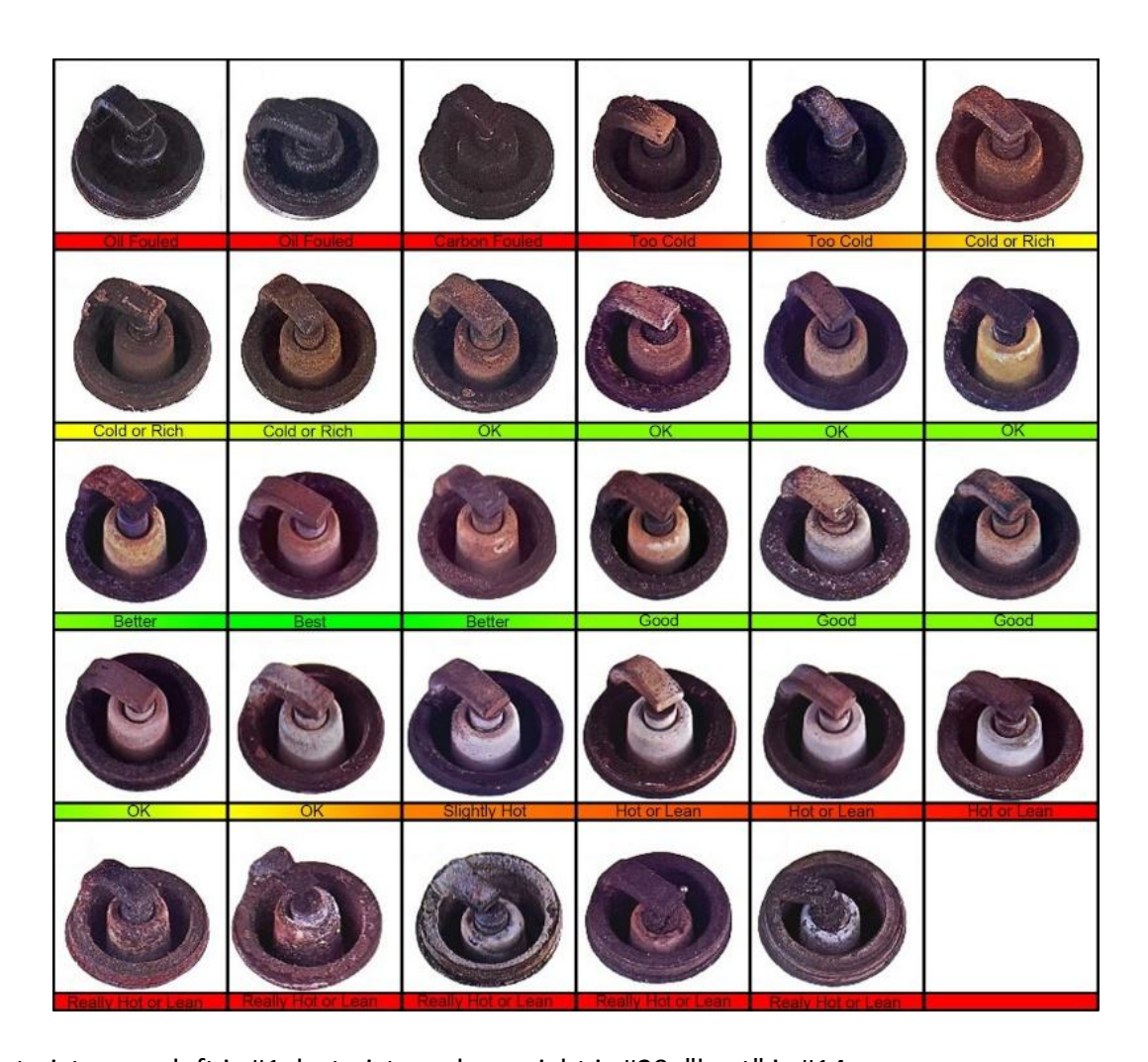
first picture up left is #1, last picture down right is #29, "best" is #14