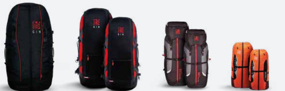
XXL Rucksack Classic Rucksack Lite Rucksack X-Lite Rucksack

*All sizes of harness tested, including the respective size of rescue plus the GIN helmet.