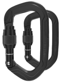
2 Edelrid Aura Alu Carabiners incl. Antitwist