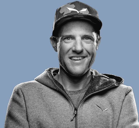
CHRIGEL MAURER Eight times X-Alps Winner

Chrigel Maurer's insight: "Pre-shaped, padded back panels on backpacks may look appealing and give the impression of comfort, but they unnecessarily add volume and weight. My experience from eight X-Alps competitions shows that the simplest, most compact and lightweight solution for stiffness and padding is to use the contents of the backpack, such as the paraglider and harness. The packed equipment creates the necessary tension, providing stability. For backpack weights up to around 15kg, this approach offers clear advantages over more complex back systems: the pack is lighter, less bulky, and the centre of gravity is closer to the back."