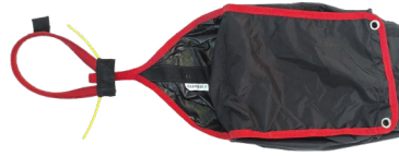
Inner container with handle