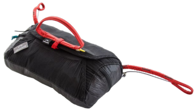
Frontcontainer Zip Light