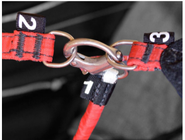
(CRS) Closure Remember System